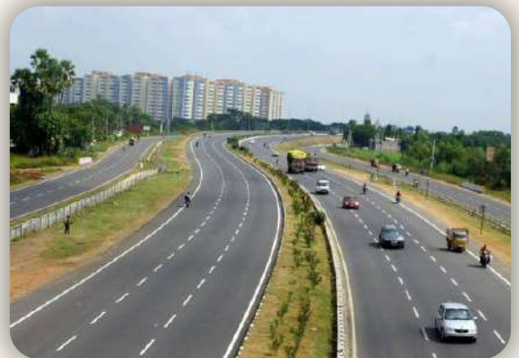
NH-17 " 1.3KM "

All specifications, designs, layout images, conditions are only indicative and some of these can be changed at the discretion of the builder/architect/authority. These are purely conceptual and constitute no legal offering.