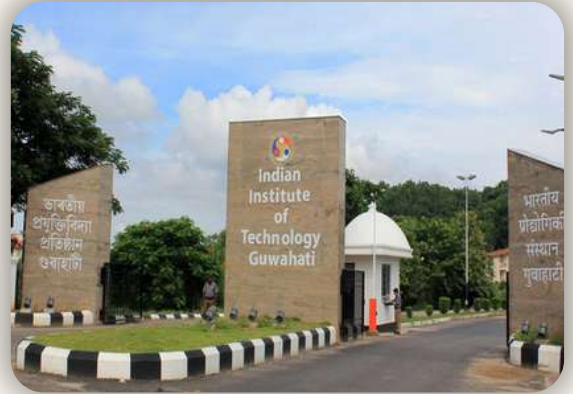
IIT GUWAHTI " 17KM "