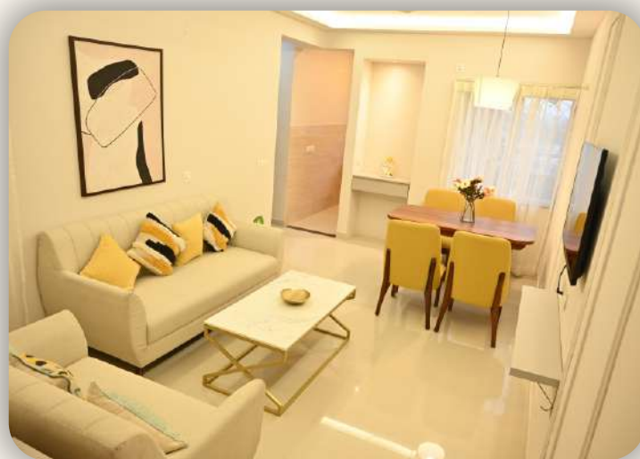
Living & Dining Room

All specifications, designs, layout images, conditions are only indicative and some of these can be changed at the discretion of the builder/architect/authority. These are purely conceptual and constitute no legal offering.