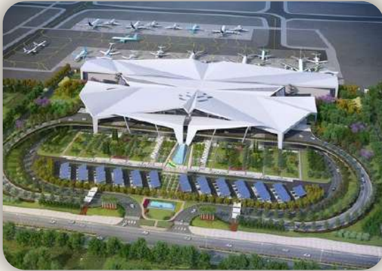
NEW AIRPORT TERMINAL " 2KM "