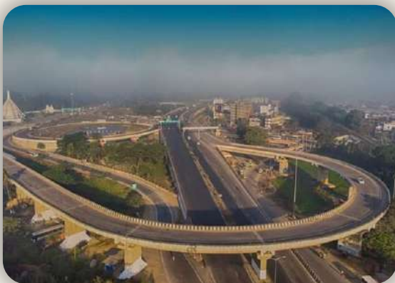
JALUKBARI FLYOVER "7KM"