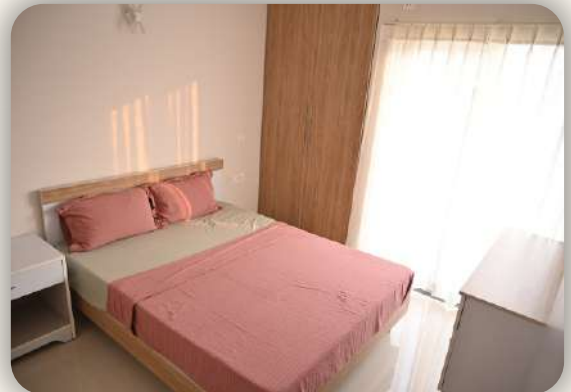
Bed Room 2