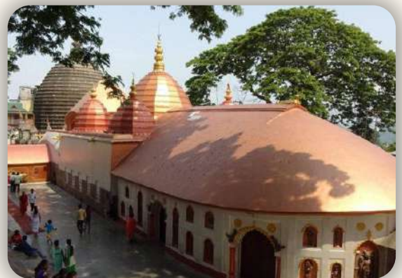
KAMAKHYA TEMPLE " 12KM "