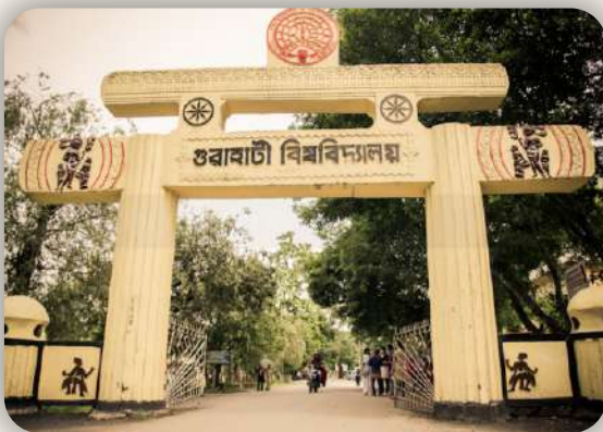
GUWAHATI UNIVERSITY " 5KM "