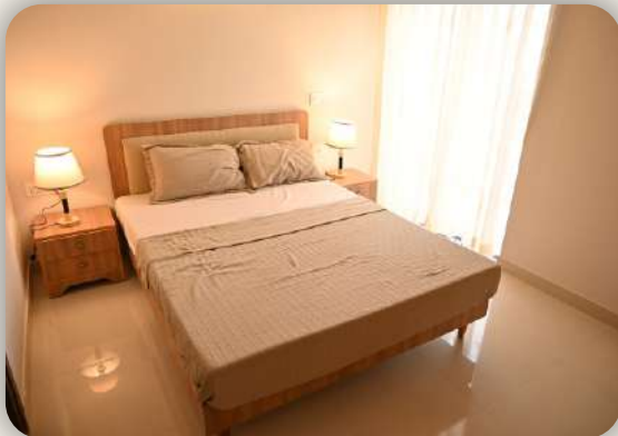
Bed Room 1