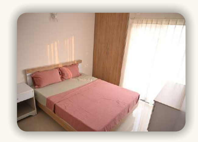
Bed Room 2