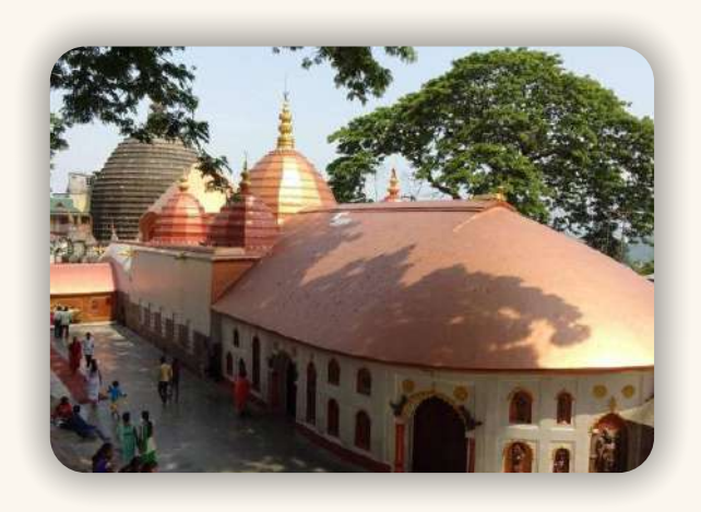
KAMAKHYA TEMPLE " 12KM "