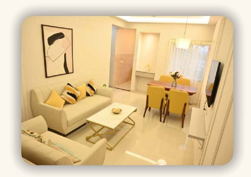
Living & Dining Room