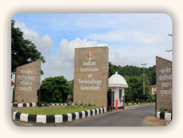
IIT GUWAHTI " 17KM "