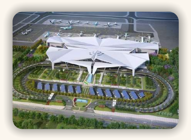
NEW AIRPORT TERMINAL " 2KM "