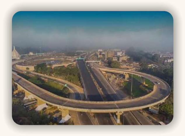
JALUKBARI FLYOVER "7KM"