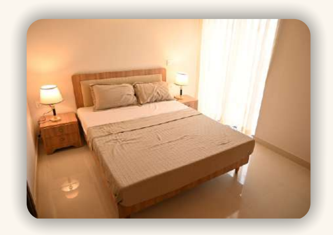
Bed Room 1