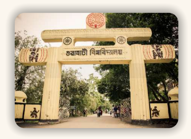
GUWAHATI UNIVERSITY "5KM"